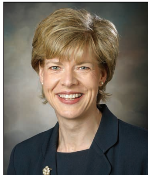
Rep. Tammy Baldwin (D-WI)

Baldwin, a member of America's Agenda's Advisory Committee, promotes co-operation on the state and federal level by building upon existing state health care programs as well as offering federal matching funds to states who adopt the Act early on. Baldwin noted that "America's Agenda plays a key role in moving these efforts forward, creating the grassroots support needed to reach our goal of health care for all." ☉