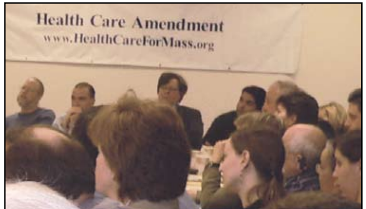
Massachusetts local union leaders plan mobilization for constitutional amendment.

With the goal of affordable health care for all in mind, Massachusetts Jobs with Justice, America's Agenda, and scores of local union leaders have joined with the Health Care for Massachusetts Campaign to launch Massachusetts Labor for Health Care. The mission is education and mobilization of union members and our allies to win passage of a universal health care constitutional amendment.