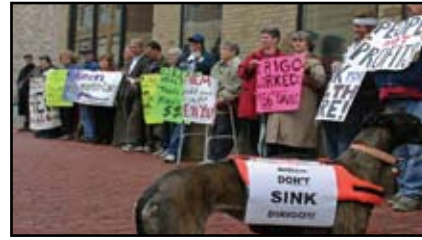
Mainers and animal friends demand that Anthem Blue Cross Blue Shield return savings generated by Dirigo Health.