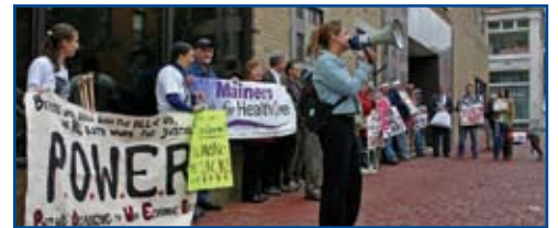
Mainers for Health Care and allies protest insurance industry efforts to sabotage funding of Dirigo Health.