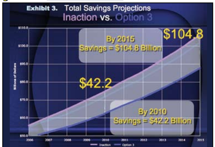
Universal coverage with an expanded public health care system.

An analysis of universal health care reform for MA done by renowned economist Dr. Ken Thorpe demonstrates that either universal health care reform option will generate billions of dollars in savings for the state. With Option 2, MA will save a net of $30.1 billion over 10 years. With Option 3, MA will save a net of $104.8 billion. Without reform these health cost savings will be forgone.