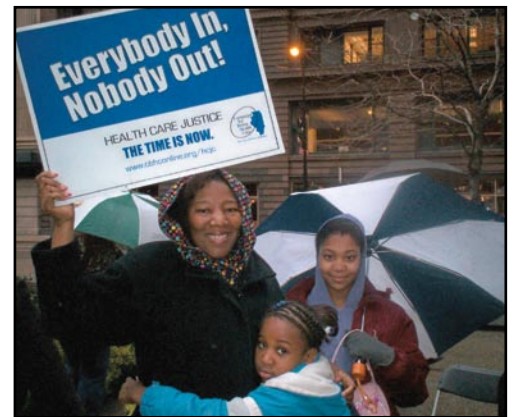
Illinois family members join in the fight for universal health care.

"Our task force has met the mandate of the Health Care Justice Act," says Jim Duffet, who was appointed to the task force by Governor Rod Blagojevich. "We've recommended a plan to resolve Illinois' health care crisis. Now, the legislature